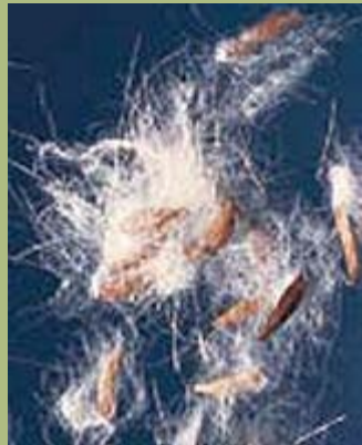
Seeds & hairs