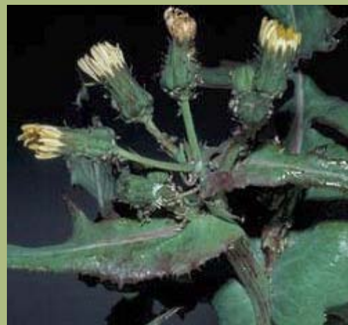
Flowerheads & leaves with scattered bristles on the margins; infested by aphids, Bilpin, NSW, September

Distinguishing features: Distinguished by non-rhizomatous habit; milky sap; leaves thin and soft, margins of leaves lobed to toothed; flower stalks and bracts around heads with or without glandular hairs, bracts around heads without dense hairs when young; bracts around heads in 3 rows, the inner row longest; all florets yellow, bisexual, fertile and with ligules 4–6 mm long; area where seeds attach to the head (receptacle) pitted, hairless; seeds 2.5–4 mm long, compressed, wrinkled, margins narrow, without a beak and topped by hairs 5–8 mm long.